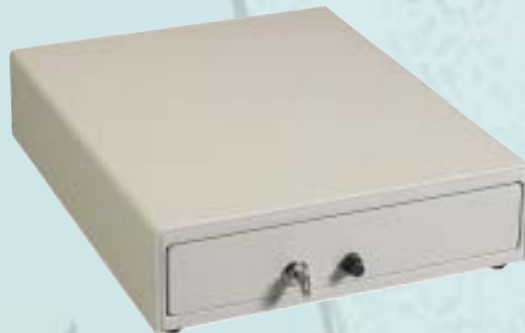
VAL- u Line Manual Drawer p/n 226-13413C012-(XX) 16" p/n 226-13416C012-(XX) 13"

The MCD 1060 is the perfect cash drawer for high traffic areas because it features a convenient "touch button" release for faster transactions! It also has a disc tumbler key lock, for extra security. An alarm bell sounds each time the drawer is opened; it can be deactivated if necessary. Space saver size fits under most cash registers or counters and comes with mounting hardware and cash tray cover. The 5 coin/5 bill Duralite Cash Tray has spring loaded plastic bill weights and the area beneath the tray can be used for check, media and currency storage. This unit is available in a Silver/Gray Hybrid Powder Coat finish. Dimensions: 17 3 / 4 " W x 15 3 / 4 " D x 3 3 / 4 " H