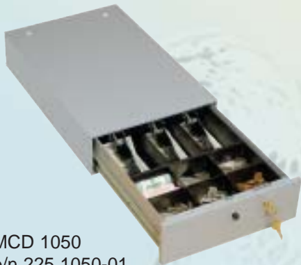
MCD 1050 p/n 225 1050-01